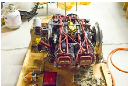
The engine for David's plane