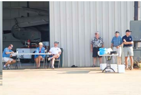
A relaxing morning at the pancake breakfast