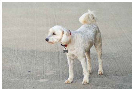
Mike watches airplanes as they depart the breakfast