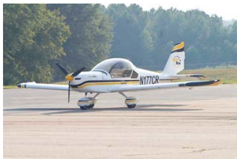
Arturo's plane sits on the tarmac