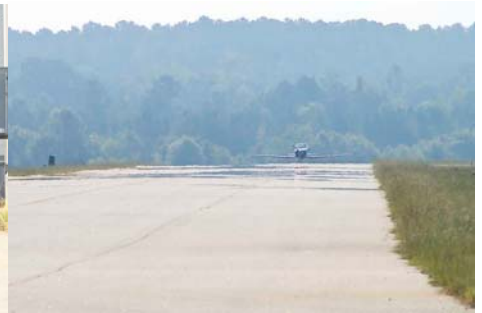
John heads back to the ramp after engine trouble