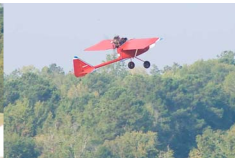
The second ultralight takes off